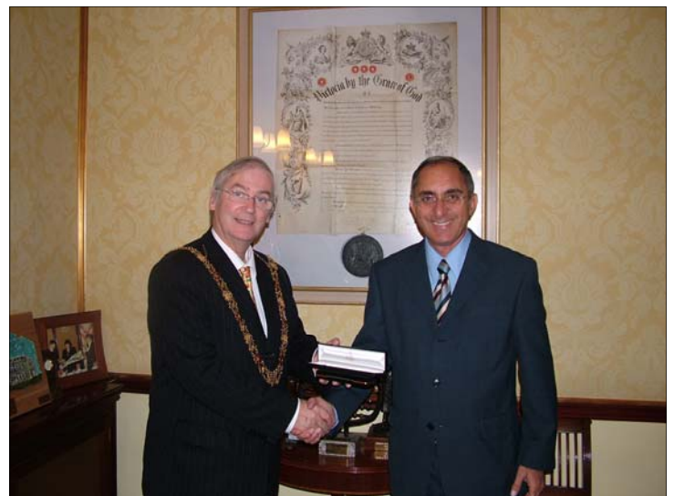
Israeli Ambassador H.E. Mr. Zion Evrony receiving a gift from Lord Mayor, Cllr. Brian Bermingham during a courtesy visit in September 2008