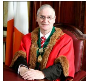
Lord Mayor, Cllr. Brian Bermingham