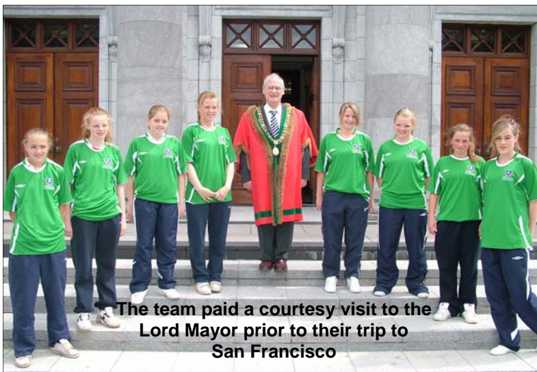
The team paid a courtesy visit to the Lord Mayor prior to their trip to San Francisco

Cork City Council, through its Sports Development Officer, issued invitations to various sporting organisations, and finally it was decided that a schoolgirls team from the Cork