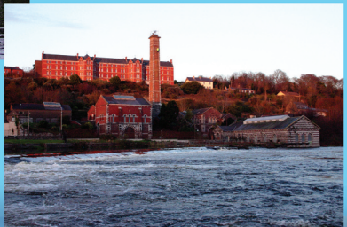
Upstream View of Site