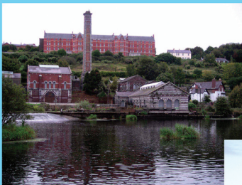
Present Day View of Site